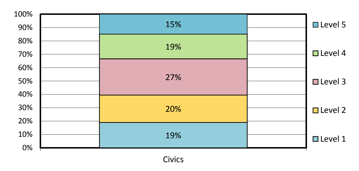
Exhibit 10. Impact Data for Reactor Panel Proposed Cuts Based on 2014 Civics EOC Assessment Student Performance