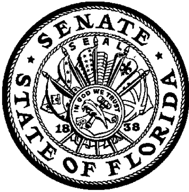
The Florida Senate