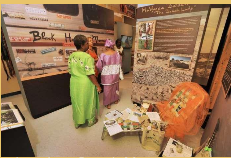
American Beach Museum