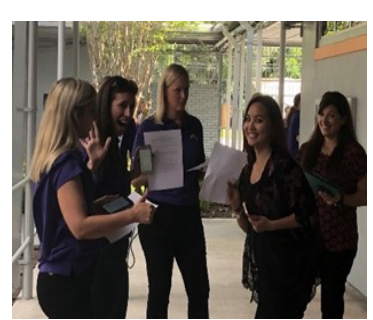
OCVS teachers participated in a Scavenger Hunt during pre-planning!