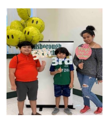
Families enjoyed documenting the start of the new school year through pictures with props!

Hillsborough Virtual School is off to an amazing start! HVS welcomed over 300 attendees to their face to face orientation before the start of the 2019-20 school year. After orientation, students and parents had the opportunity to meet their teachers and interact with new classmates. HVS is looking forward to a year full of innovation and interaction!