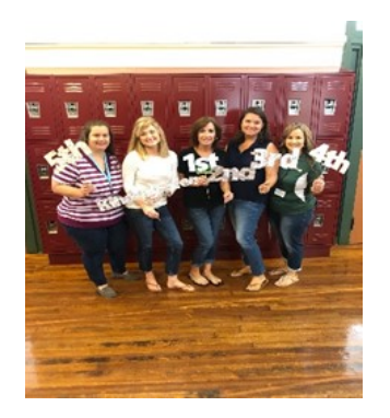
The enthusiastic K-5 teachers couldn't resist the props either!