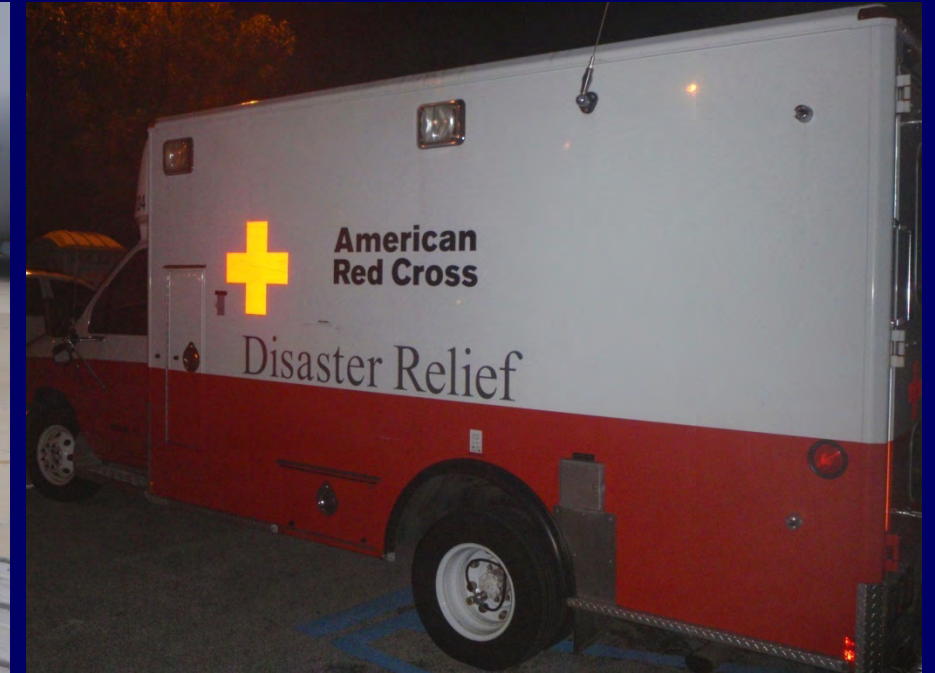
Sanford International Airport, Orlando

174 American Red Cross workers have provided to 2,400 meals, 4,500 snacks, 48 comfort kits, and 350 blankets, serving a total of 3,641 repatriated U.S. citizens in Orlando, Miami, Fort Lauderdale, and Palm Beach.