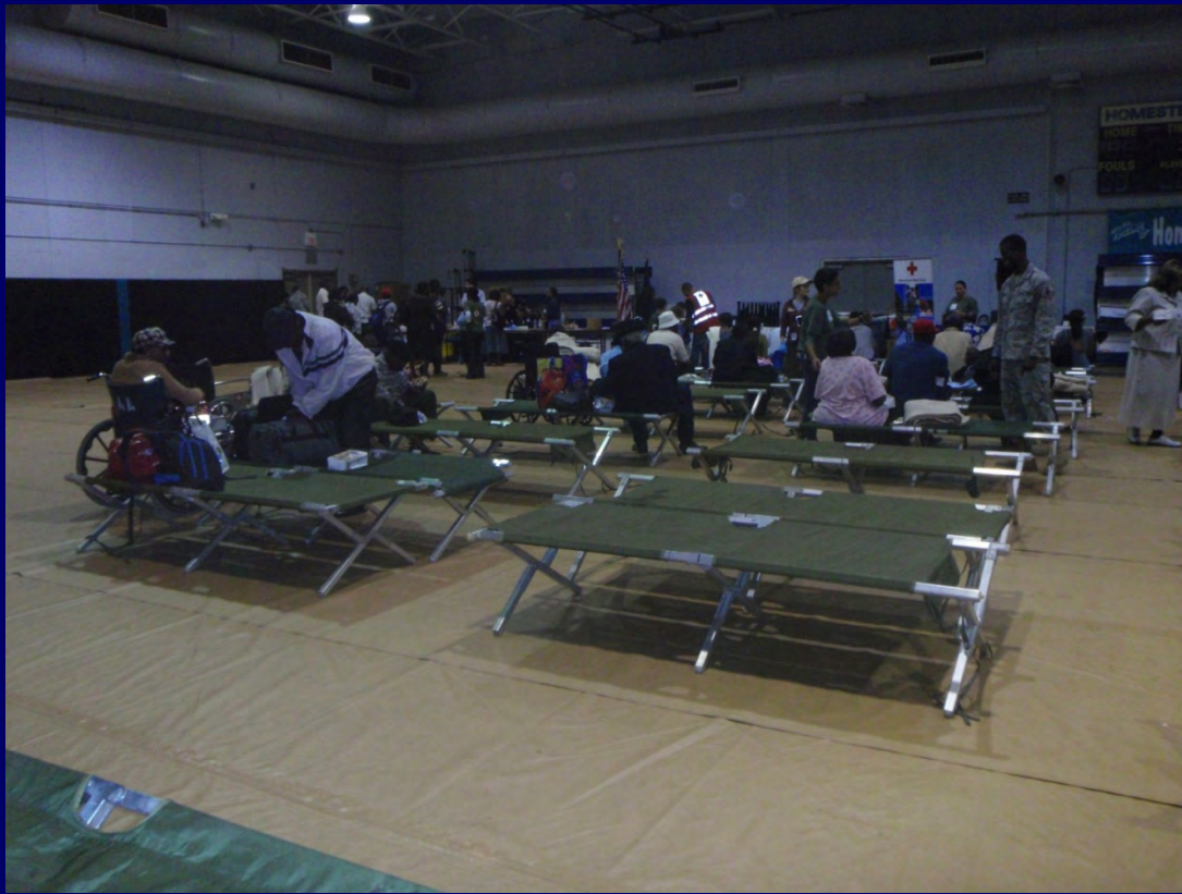
Homestead Repatriation Processing Center

2 recovery staff members of FDEM are on site at Homestead AFB in response to a request by DCF for assistance in tracking costs at the repatriation processing center. An additional 2 FDEM personnel are at the Sanford Repatriation Processing Center.