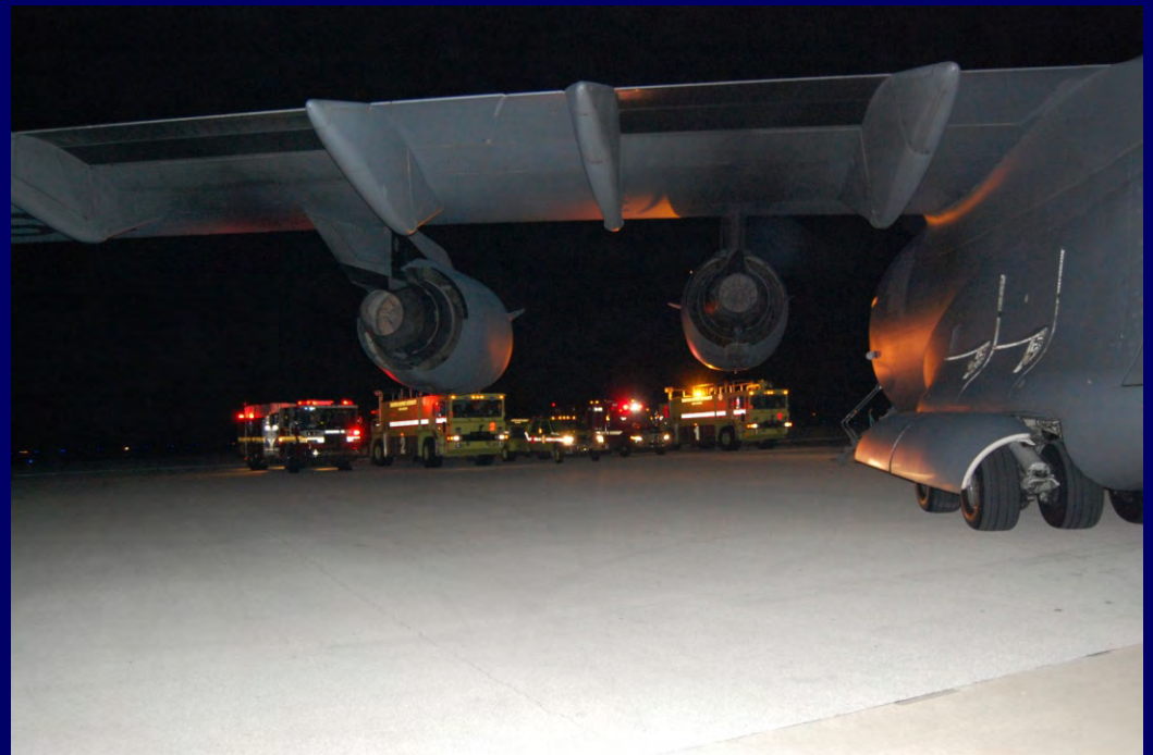
Sanford International Airport, Orlando

-This is a forward element of a federal request for a larger SMRT.