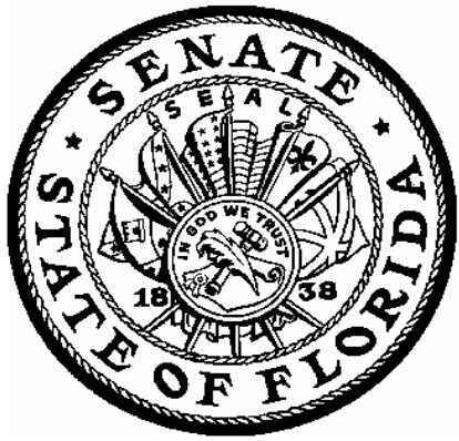
The Florida Senate