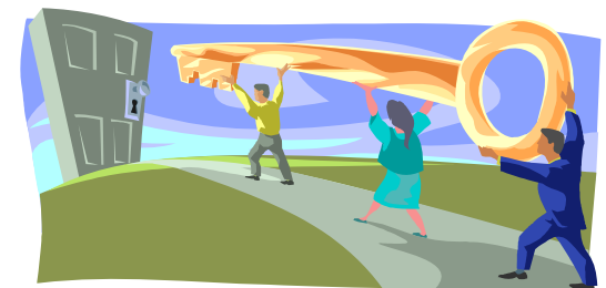
Mediation is the key.

Mediation is provided at no charge to parents. Mediators involved in mediation for students with disabilities are paid for by the Florida Department of Education, while districts pay for gifted education mediation. Each party is responsible for their individual expenses.