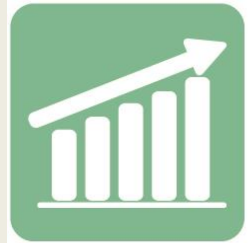
Marketing, Sales & Service