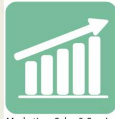
Marketing, Sales & Service