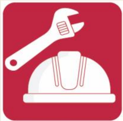
Architecture & Construction