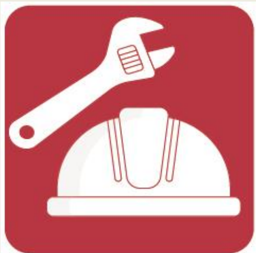
Architecture & Construction