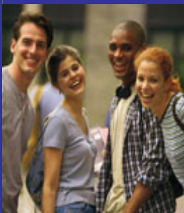
The Nation's Report Card

NAEP started in 1964 through a grant from the Carnegie Corporation to set up the Exploratory Committee for the Assessment of Progress in Education. The first national assessments were conducted in 1969. Voluntary assessments for states began in 1990. In 2003, NCLB mandated participation in NAEP Assessments as a prerequisite to receipt of Title I funds.