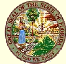
Higher Standards and Accountability Work